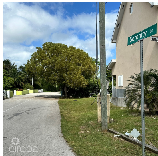
10/29/25, 12:39 PM Export.jpg (2168x1700)